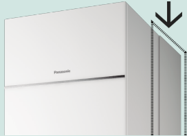
PAW-ADC-CV150. Sidoskydd med rörlåda på baksidan